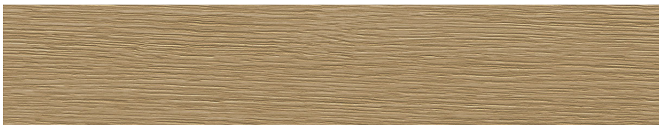
Archisonic Riftcut Flax 50